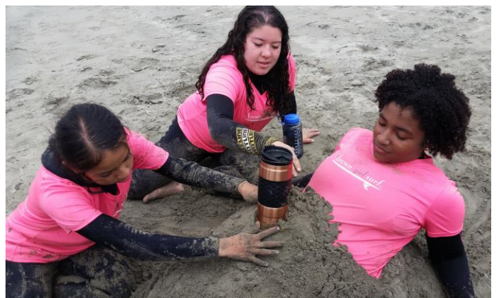
Brown Girl Surf's Surf Sister Summer Camp 2018!