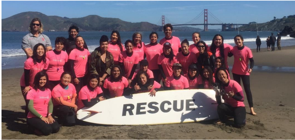
The 2019 Brown Girl Surf Ocean Safety Training