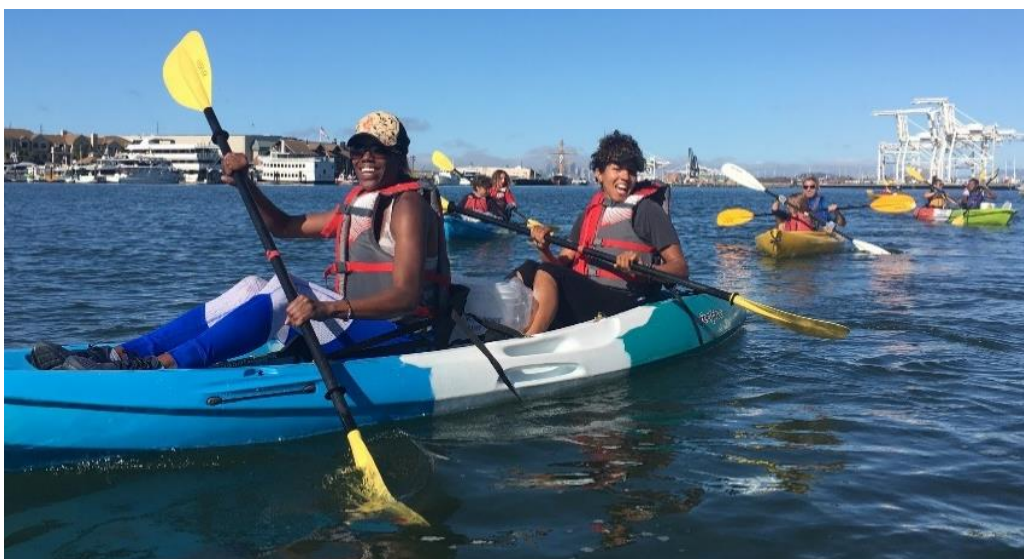
2018 Creek to Bay Kayak Cleanup!

We're hosting the 2019 Creek to Bay Day Kayak cleanup on September 21, in partnership with the City of Oakland and the California Canoe and Kayak Company. This is part of the California and International Coastal Cleanup Day, the largest volunteer day in the world! This event is open to everyone! Past Surf Sister Saturday or Summer Camp participants receive complimentary kayak rentals for themselves and one guest. Register here and come join us in Jack London Square!