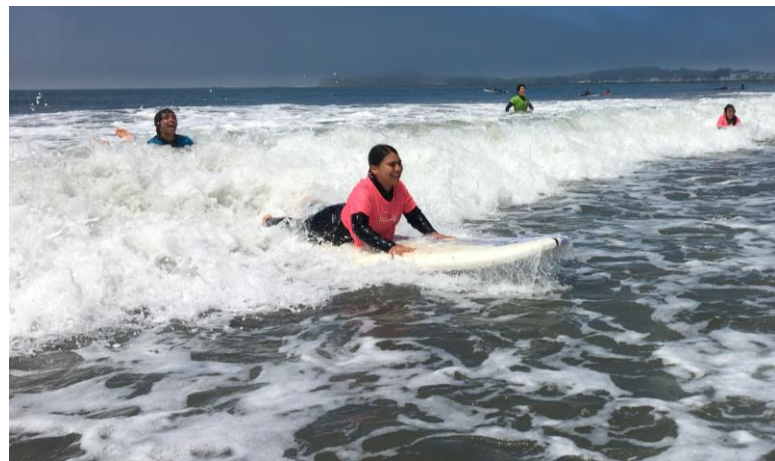
2019 Surf Sister Summer Camp!