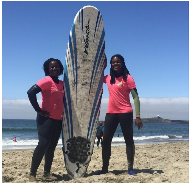
2019 Spring Surf Sister Saturdays!

Our redesigned Surf Sister Summer Camp was a huge success! Historically, our summer camps were held Tuesdays to Thursdays in Half Moon Bay. This year, thanks to the Whale Tail Grant and a new partnership with East Bay Regional Parks, we were able to add an extra day at Alameda Crown Beach on Mondays. The additional day allowed us more time for team building, and learning about our amazing ocean. We developed an all new environmental education curriculum – including games about food chains, and activities linking climate change and pollution to our everyday actions. Through seine netting and plankton tow activities, campers discovered various critters that can be found in our local waters off Alameda – and we were surprised to find out that the same organisms can be found in Half Moon Bay! With more knowledge and curiosity, we explored the beach on the subsequent surf days and identified sea lettuce, isopods, jellyfish, crabs, and more!