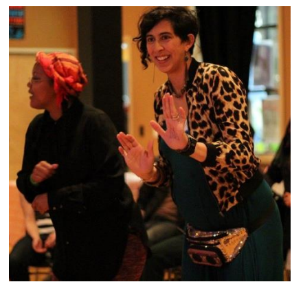
Photos from our Year-End Celebration in December